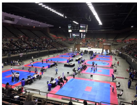
California State Championship

*California State Championships will not have Dragon, Tiger and Youth Team Poomsae, or Color belt Co-Ed Teams. Those divisions will not be available at the USA Taekwondo National Championships.